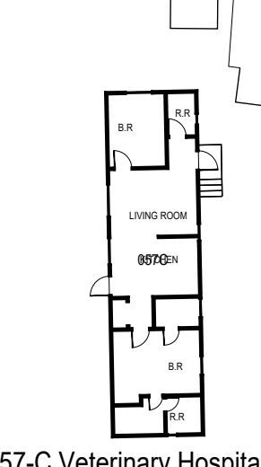
057-C Veterinary Hospital Res. Trailer (M020) 1st Floor Plan